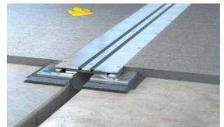
SS Slip Resistant Expansion Joints ADA Compliant - Floor to Floor