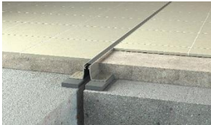
Single Seal Expansion Joints Floor to Floor/Wall

For more than 18 years we have been providing recognized solutions for all type of buildings. Our capability to work with Consultants, Architects, Contractors to incorporate their design and supply the most economic and elegant solutions for movement, fire barriers etc. has made us one of the pioneers in the market.