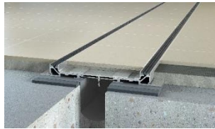
Seismic Expansion Joints