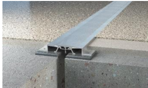
Metal Expansion Joints Floor to Floor/Wall (25-125mm)