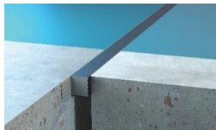
Multi-Purpose Seal Expansion Joints Floor to Floor / Wall to Wall