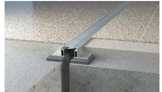
Metal Expansion Joints Floor to Floor/Wall (50-150mm)