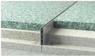
Control Joints Floors