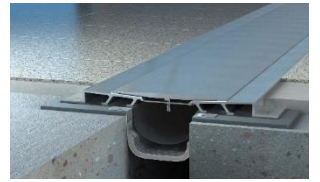
Fire Barrier System Floor to Floor/Wall